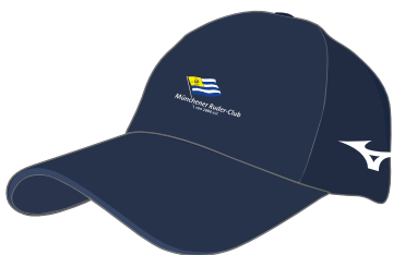
ZUNARI TEAM CAP